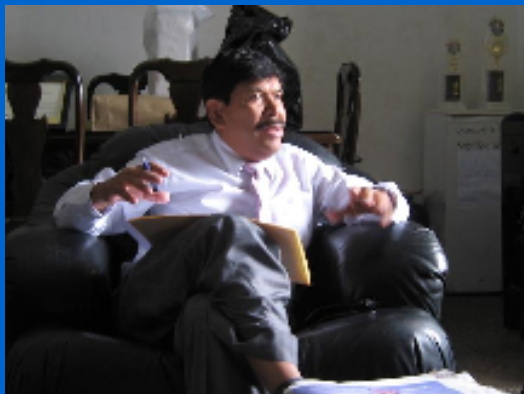
The Mayor of Antigua