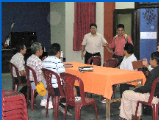
Meeting with pastors of evangelical churches to plan outreaches to the ghetto area of San Pedro

immigration and met me at the baggage claim. The attendant asked us for our customs declaration cards and told us to follow her. She went to one of the agents reviewing the customs declaration cards and spoke for a moment—then the agent simply waived us through. PRAISE GOD! With these first two miracles being performed, we knew this would be a God-ordained trip. We knew that many were praying for our trip, and we felt and saw the promise that Jesus gave in Matthew 18:19-20. THANK YOU for praying and agreeing with us!