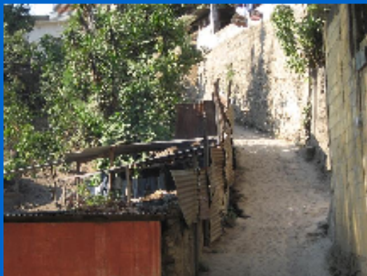
Two mile path leading to the San Cristobel outreach church