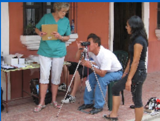
Eyeglass exam in progress.