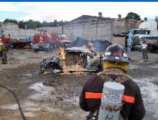
Practicing vehicle fires.