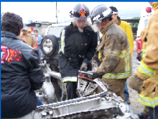
Extrication training for the volunteer firefighters, using their antiquated model of the "jaws of life."