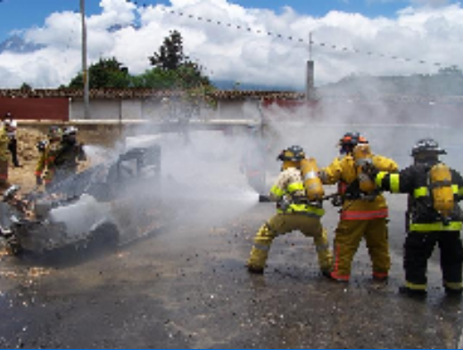
Practicing putting out a car fire after extrication training was done.

Chief Carlos and the volunteer firefighters once again welcomed our group with open arms. This trip we brought them two pairs of size 9 bunker boots (a little too big for most of them), ten center punches (five of which have seat belt cutters built in) two spanner wrenches, and two pairs of trauma shears. Even though these are basic tools that are used every day, the firefighters here don't have any of the tools and their boots are very old and very "well used." We began with extrication training. Carlos was able to get an old vehicle for us to practice their current extrication techniques and allow me to show them some tips and a few new techniques. Their thirst for knowledge and attentiveness was overwhelming. Even though most did not speak any English or very little, they were hanging on every word trying to get everything they could out of it.