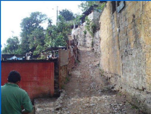
Start of the two mile climb to the house church in San Cristobel, a ghetto area of San Pedro.