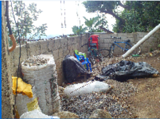
"Room" in the house where the ghetto church is located. The adults are currently meeting here, and we are going to supply the materials to complete these walls, plus two more walls and a roof.

Florida Dept. of Agriculture & Consumer Services Registration #CH31165. A COPY OF THE OFFICIAL REGISTRATION AND FINANCIAL INFORMATION MAY BE OBTAINED FROM THE DIVISION OF CONSUMER SERVICES BY CALLING TOLL-FREE (800-435-7352) WITHIN THE STATE. REGISTRATION DOES NOT IMPLY ENDORSEMENT, APPROVAL, OR RECOMMENDATION BY THE STATE.